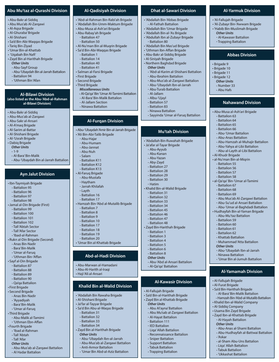
Figure 3: A Selection of Islamic State Military Units, Late 2016

The reconstruction of the unit structure of Islamic State military units appears in Figure 3.<sup>106</sup> A key point is that although Figure 3 displays all of these units on a single page, the existence of intraunit relationships is not depicted and should not be assumed or denied based on this information. For example, units may be shared between divisions or fighters transferred upon request of other officials within the Islamic State's governance structure. Moreover, as the military needs of the overall caliphate, as well as those of local governors, have changed, recent research has suggested that the Ministry of Soldiery may have delegated more of its specialized forces and units to the control of local officials to meet immediate combat needs.<sup>107</sup>