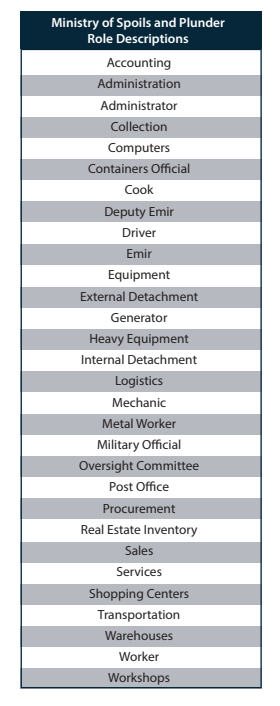
Table 10: Role Descriptions of Individuals Coded as Belonging to the Ministry of Spoils and Plunder

Another one of the Islamic State ministries for which the role descriptions in the main spreadsheet provides interesting insight into the organization is the Ministry of Spoils and Plunder.<sup>75</sup> This entity, according to the Islamic State's July 2016 video outlining the structure of the caliphate, is responsible for taking in and accounting for goods captured from enemies by Islamic State personnel, as well as the distribution of those goods.<sup>76</sup> There is some indication in primary source documents that this entity may have once (as late as 2013) been subordinate to another ministry, although in these spreadsheets it appears to be a separate ministry.<sup>77</sup>