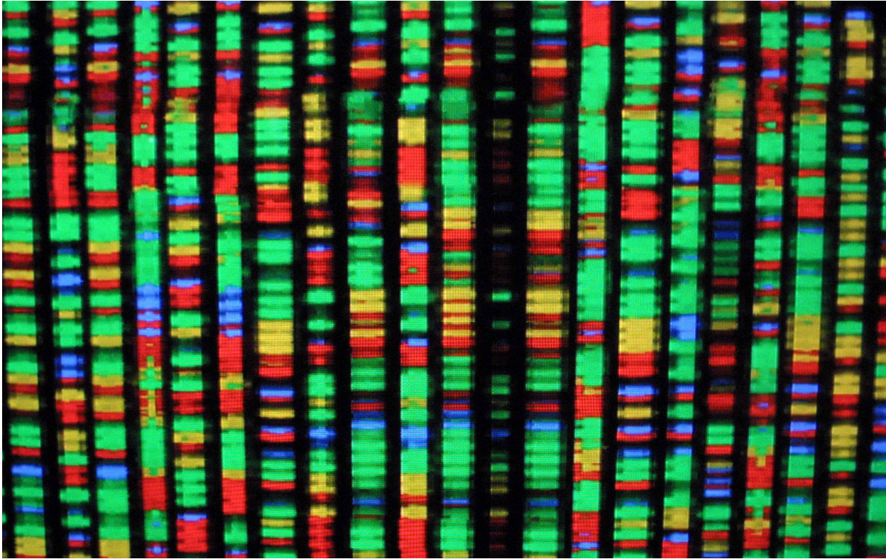
A digital representation of the human genome is pictured on August 15, 2001, at the American Museum of Natural History in New York City. Each color represents one of the four chemical components of DNA.

various types of additive manufacturing b printers that create layered arrangements of cells and support structures that theoretically could facilitate the production and delivery of biological weapons. 16 Desktop bioprinters are becoming cheaper, smaller, and more accessible, and they will soon be as available as desktop printers are.