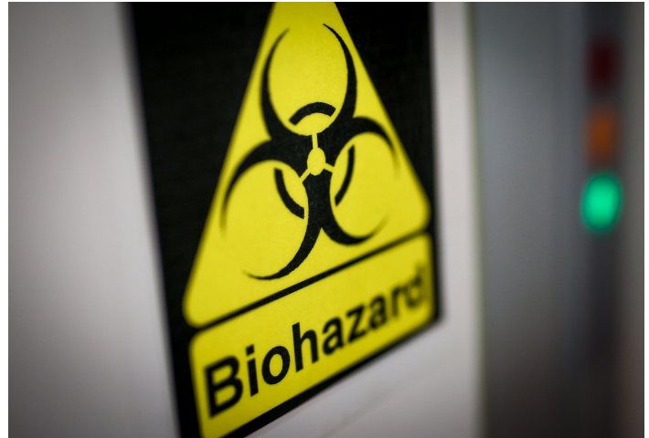
A biohazard sign is pictured on a restricted area door at a virology institute on March 3, 2020.

IBBIS’ initial activities will focus on DNA synthesis screening, b in order to prevent the building blocks of dangerous pathogens from falling into the hands of malicious actors. c However, IBBIS’ scope of activities will expand over time to encompass multiple intervention points throughout the bioscience and biotechnology research and development life-cycle, such as: