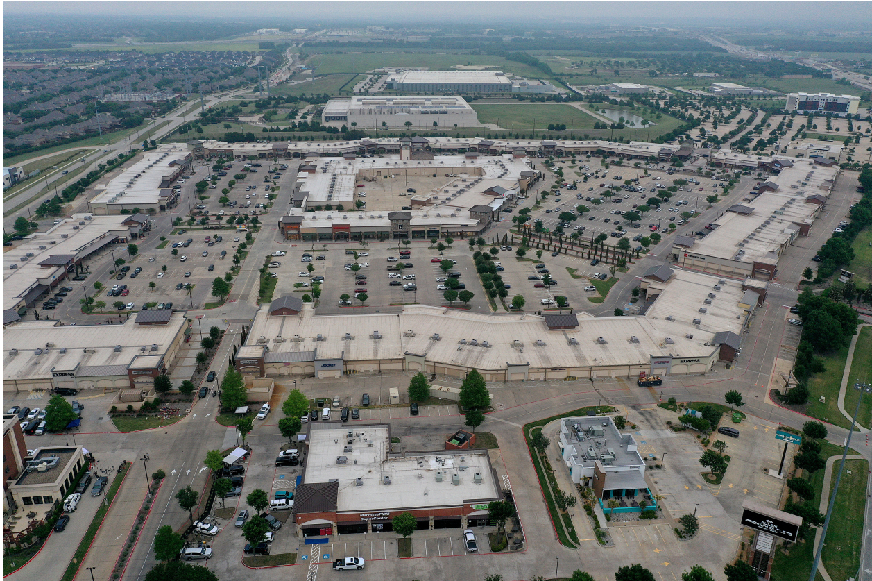
The Allen Premium Outlets mall in Allen, Texas, is seen on May 8, 2023, two days after a mass shooting occurred there.

visited the mall on May 14, 2022, January 7, 2023, and April 15, 2023—and another screenshot showing the mall’s busiest times and an indoor map of the facility. 6 This approach was similar to that of the Buffalo, New York, shooter, who also conducted extensive research on his target (a supermarket frequented by Black patrons) prior to his attack and utilized Google’s “popular time” feature to select the best time to carry out his attack. 7 The Allen, Texas, shooting is another example of a racially and ethnically motivated violent extremism incident taking place at a retail location, as opposed to a place of worship, for example. Large retail locations are becoming one of the preferred soft targets for those seeking to carry out a mass casualty attack. b