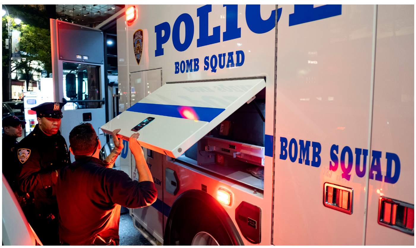
New York City police officers clear the scene after a report of a possible suspicious package was called in at the Time Warner Center on October 25, 2018, in New York.

selection. <sup>51</sup> For example, drawing on federal court documents from 2016 to 2022, one report finds evidence that salafi-jihadi and white supremacist attack planners have largely targeted different U.S. critical infrastructure sectors, with "the former focusing on the commercial facilities, government facilities, and emergency services sectors, and the latter predominantly focusing on the energy sector." This suggests distinct underlying logics—corresponding with different ideological foundations and related objectives—behind the use of IEDs by violent extremists in the United States.