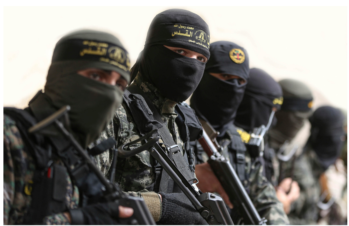
Gunmen from Saraya al-Quds, the armed wing of the Palestinian Islamic Jihad, are pictured on April 8, 2022, during an anti-Israel protest in the city of Khan Yunis in the southern Gaza Strip.

to shutter the group.<sup>65</sup> The group, numbering only around 300, also had leadership elements in Iran.<sup>66</sup> Sabireen even adopted Lebanese Hezbollah-style iconography to further make clear its true loyalties.<sup>67 f</sup> Harakat Sabireen also actively disobeyed Hamas' strictures when it launched rockets into Israel.<sup>68</sup>